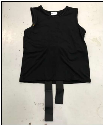
Lay T-Shirt Flat