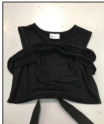
Roll up the outer T-Shirt