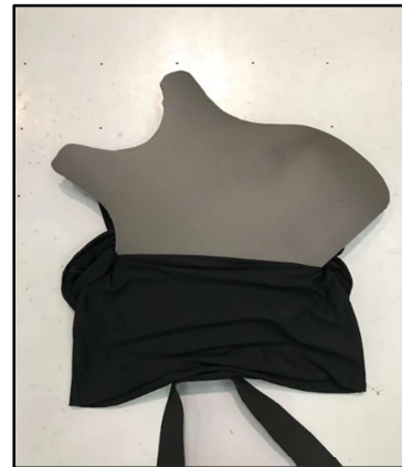
Insert the front panel into internal pocket