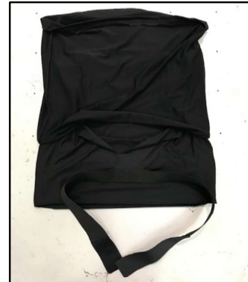
Turn the T-Shirt over – back facing up