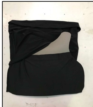
Bring the outer T-Shirt over the panel