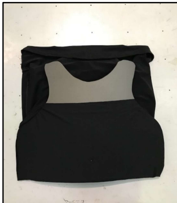
Push panel into the pocket.